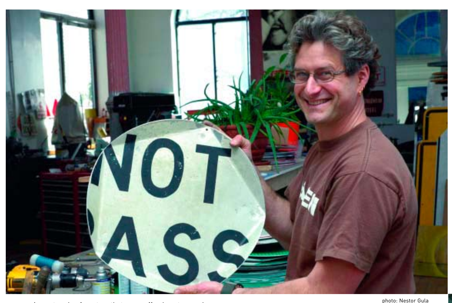
A great saying for a tray that came off a do not pass sign.