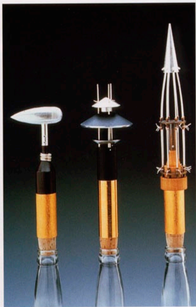
Boris Bally. "Streamlined" bottlecork, "Dark Pagoda" bottlecork, "Warhead" cage bottlecork. Silver, gold, aluminum, gold-plated brass, maple, ebony, cocobolo. Fabricated, pressed, lathe turned, cold joined. Tallest 11 x 3" diam. Jack Brubaker. Triple vertical wine rack. Iron. Forged. 30 x 6 x 10"